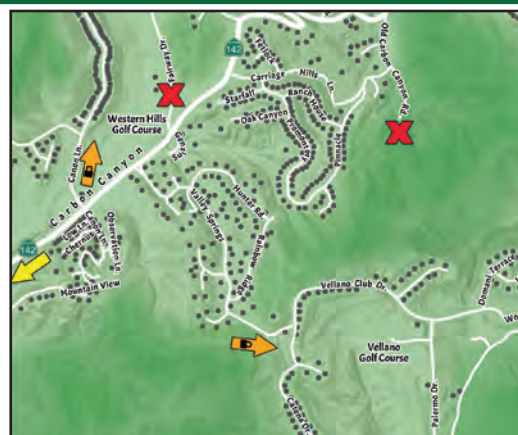
Chino Hills (East) Map