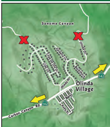
Olinda Village Map

The Carbon Canyon Fire Safe Council's mission is: to preserve our canyon's natural and man-made resources on public and private property by development and enforcement of ecologically sound and appropriate fire safety measures.